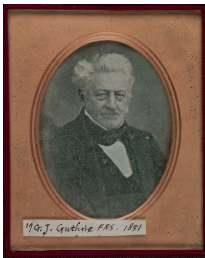
Fig. 3 Daguerreotype of George James Guthrie.

As an Army surgeon Guthrie served in North America and then in the Peninsular Campaign with Sir Arthur Wellesley (later Duke of Wellington). He distinguished himself as a surgeon. In August 1808, at the Battle of Vimero, he was shot by musket ball in both legs [10]. Later that year he almost died of Typhoid fever in a very similar episode to Larrey.