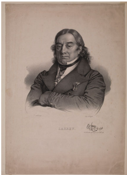
Fig. 2 Jean Dominique Larrey.

fought with France. His fame saved his life when at Waterloo he was captured by the Prussians and ordered to be shot. Luckily a Prussian Surgeon recognised him as the famous Larrey. He was personally released by Marshall Bulcher, whose son Larrey had previously treated.