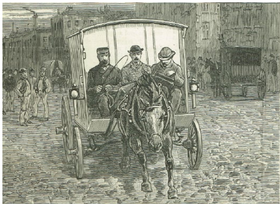
Figure 3. The Liverpool Horse Ambulance, 1886. Author's collection.

set). Thus, the patient had medical care from door to door, making it more like a modern paramedic service than the 'scoop and run' ambulances that came later. Prior to this, patients were bundled into a taxi or transported by other private means. Incidentally, a sedan chair had been provided for ill or injured patients by the Glasgow Royal Infirmary since 1794 3 .