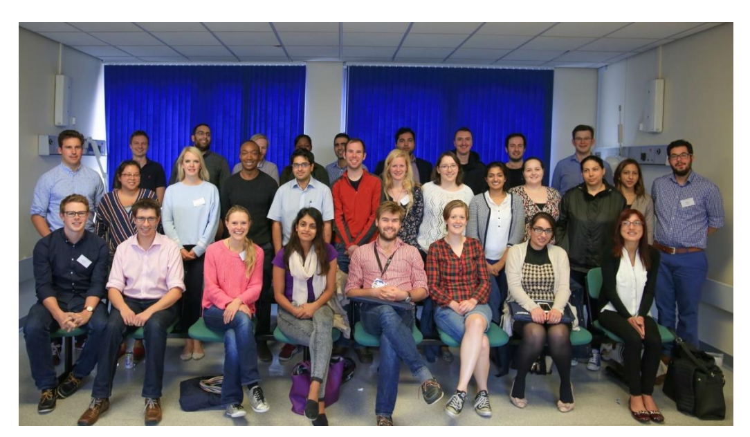
Trainees at the 2nd Urology Simulation Boot Camp, Leeds, September 2016

The course is supported by BAUS and the SAC in Urology and is recommended for all new ST3 in urology. Next year's course will again be held in Leeds on 10– 14 October 2017. For further information, please follow on twitter @UrologyBootCamp.