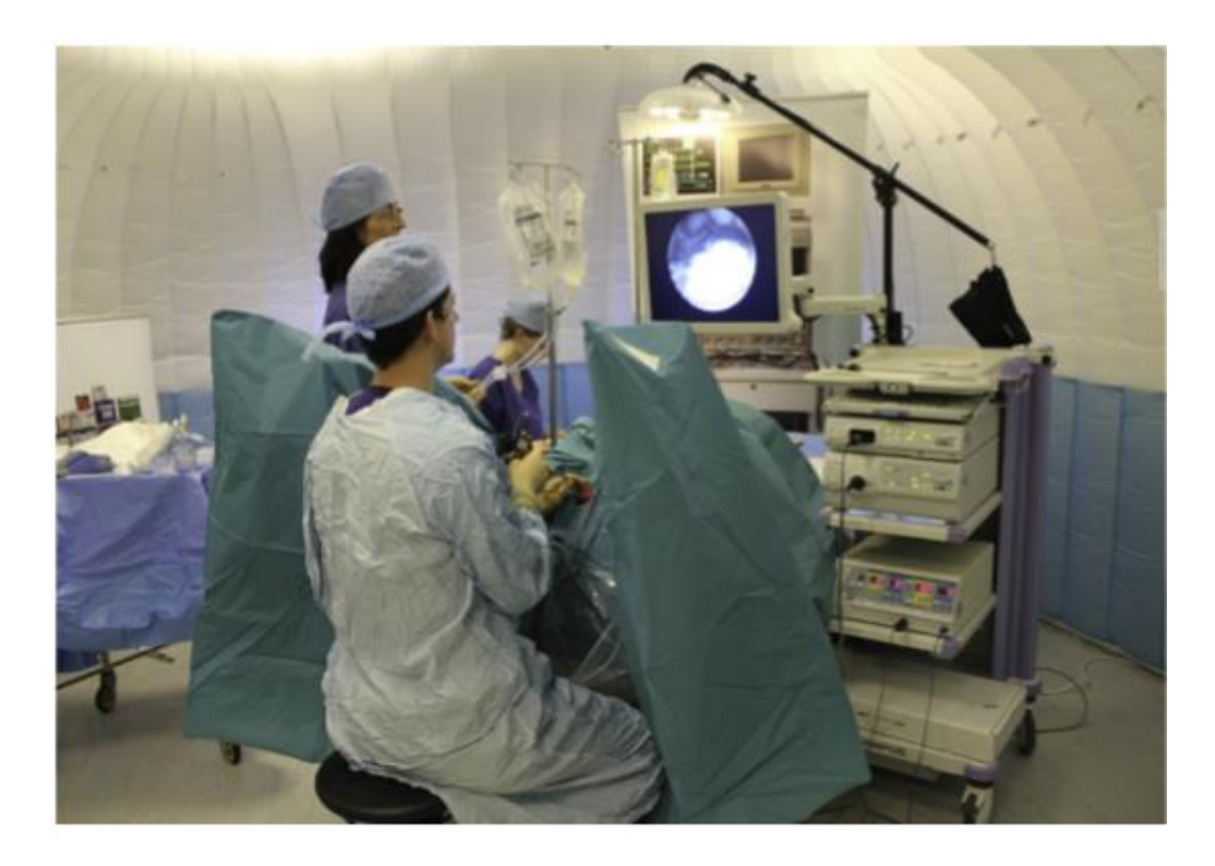
Fig 2.) Simulated urology operating suite portraying the outstanding fidelity level established in the NTS simulation training studies conducted by Lee et al. and Gettmann et al. Note the participation of the wider operating team, further enhancing simulator realism. Simulated NTS training has been shown to augment intraoperative practice of even the most senior urologist, reinforcing the power of simulation as a urological training adjunct (from et al).

practice of even senior urologists also benefit from simulation training. These studies reinforced the benefits of simulation as a valuable surgical training adjunct beyond the scope of junior training.