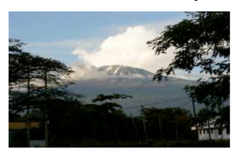
Figure 2 – Mount Kilimanjaro from the grounds of KCMC

We arrived 2 days before the start of the workshop, some with luggage, some without..... The weather was warm and dry. The "short rains" were expected but had not arrived. The hour long journey from Kilimanjaro airport to Moshi was under the watchful eye of Mount Kilimanjaro an amazing sight to see in both daylight and moonlight with its snow-capped summit. For the next couple of days we got accustomed to the climate, the food and the odd beer before visiting the hospital. I'm not sure what I expected from the hospital or the urology department but it was fantastic to see such a well organised, clean and self-sufficient unit. Professor Mteta showed us around and the lecture hall had been decorated for the start of the meeting.