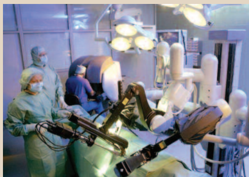
The Da Vinci robot.

Next time: a forgotten pioneer of our specialty.