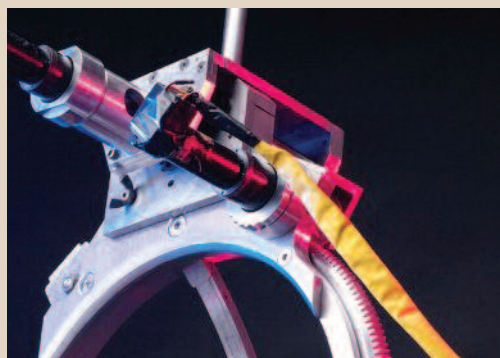
The Probot (photo courtesy of Imperial College, London).