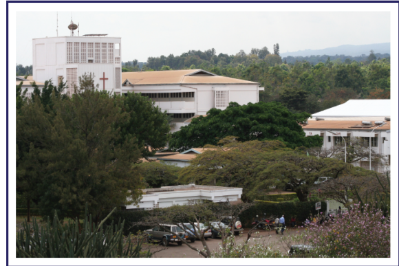
Figure 1: The urology team - Dr Meteta (back row - centre right) and Dr Mbwambo (front row - centre right) with visiting trainees from across East Africa. The hospital takes up a commanding view on the outskirts of Moshi.