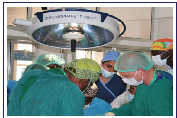
Figure 5: My fellow trainees and theatre staff worked hard together and the air is filled with upbeat singing, music and positive energy during operations and throughout the day.