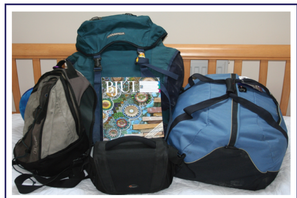
Figure 3: The Art of Packing - personal gear, medications, clinical supplies plus computers and cameras needed to be carefully stored for the long journey. Lock and wrap your bags!