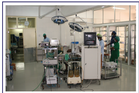
Figure 2: The wards and operating theatre are clean and functional, although lack the basic and specialist equipment often found in contemporary hospitals in Europe.