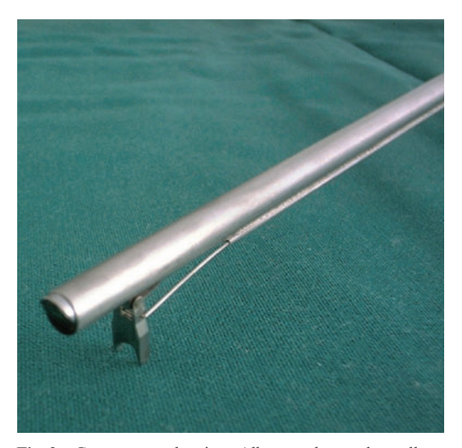
Fig. 2 Cystoscope showing Albarran lever that allows deflection of ureteric catheters to assist ureteral orifice cannulation.