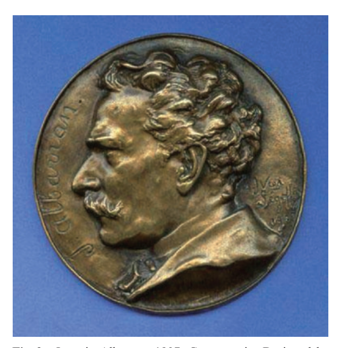
Fig. 3 Joaquin Albarran, 1907. Copper coin. Designed by French sculptor Jean Victor Segoffin (1867–1925) and signed by the Sculptor behind the bust.

His interests also included renal physiology and led him to devise a clinical polyuria test for renal insufficiency – the Albarrans test. Albarrans test consists of evaluation the degree of loss of renal function by measuring urinary volume and concentration.<sup>9</sup>