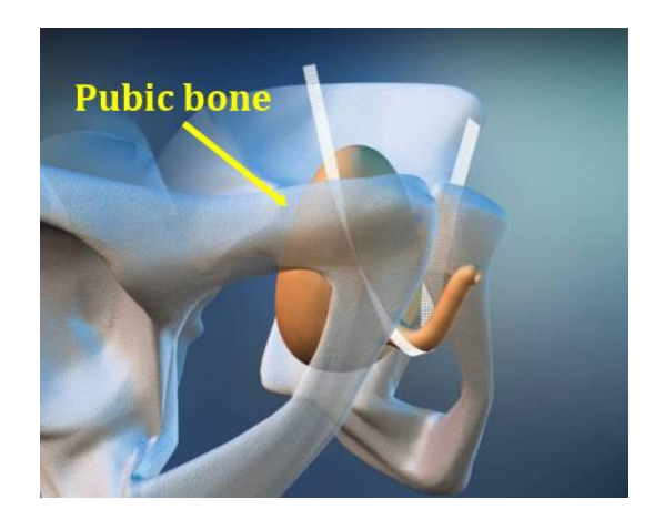
TVT is the longer established mesh tape procedure

The top ends are passed upwards using two small cuts in your lower abdomen (tummy)