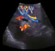
Normal kidney flow using wide field of view X12C4 robotic Drop-In transducer

For more information, email info.uk@bkultrasound.com