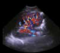
Color flow Doppler of kidney 6C2s transducer

The NEW bk5000 brings urological imaging to a whole new level. It is seamlessly integrated with MRI/Fusion systems , supports Robotic-Assisted surgery , and brings advanced modes like elastography and contrast imaging to help you quickly and confidently identify regions of interest.