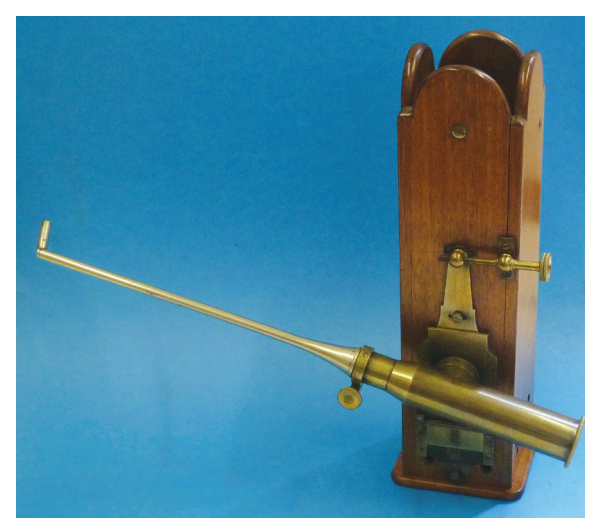
Figure 1: The Cruise endoscope of the Medical School Museum, Manchester.

Position your patient in an easy armchair, reclining with his buttocks resting on the edge and his knees apart. Then kneeling in front of the patient pass the greased urethral speculum (with its blind obturator in position) into the urethra (as yet unattached to the endoscope). Once the tube is against the sphincter place a greased finger into