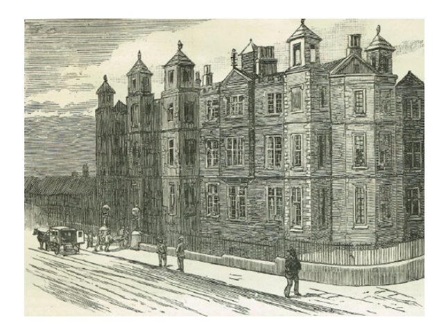
Figure 2. The Northern Hospital, Liverpool, 1886.

the Royal College of Surgeons (FRCS) on 13 December. By 1874 he was Full Surgeon to the Royal Infirmary as well<sup>1,2</sup>.