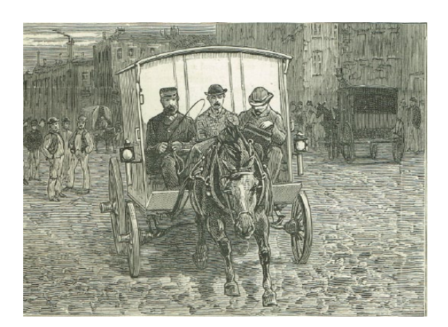
Figure 3. The Liverpool Horse Ambulance, 1886.

set). Thus, the patient had medical care from door to door, making it more like a modern paramedic service than the 'scoop and run' ambulances that came later. Prior to this, patients were bundled into a taxi or transported by other private means. Incidentally, a sedan chair had been provided for ill or injured patients by the Glasgow Royal Infirmary since 1794<sup>3</sup>.