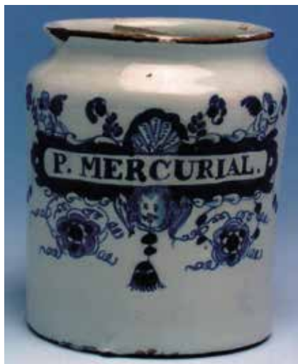
Figure 1: Apothecary's jar c.1750 for Pilulae Mercuriales .

It was advocated by Philippus Aureolus Theophrastus Bombastus von Hohenheim (1493-1541), also known as Paracelsus, a Swiss doctor and alchemist during the Renaissance. He was a fascinating figure, rejecting the accepted dogma of Hippocrates and Galen, he supported experimental medicine ("The patients are your textbook, the sickbed is your study")