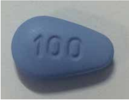
Figure 2: A 100mg tablet of sildenafil citrate. With thanks to the Pharmacy Department of Leicester General Hospital.

breaking; over $1 billion worth were sold in its first year. Pfizer's medicines patent for Viagra has now expired and generic sildenafil is available and can be bought off prescription from pharmacies – it's still blue however (Figure 2).