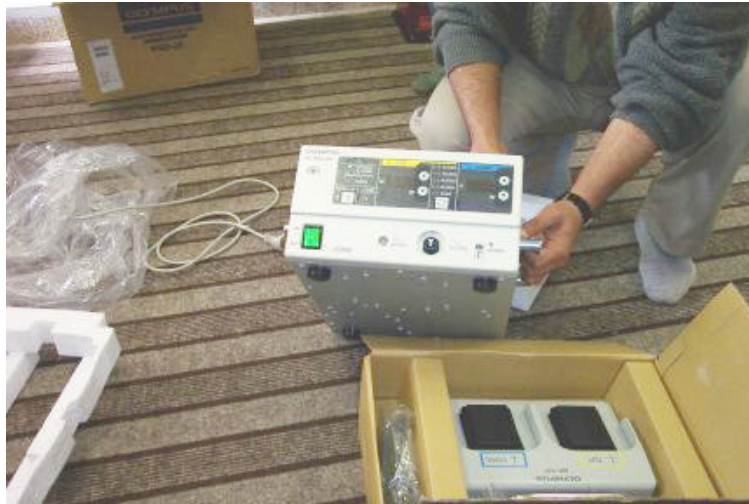
New machine in stores, unused