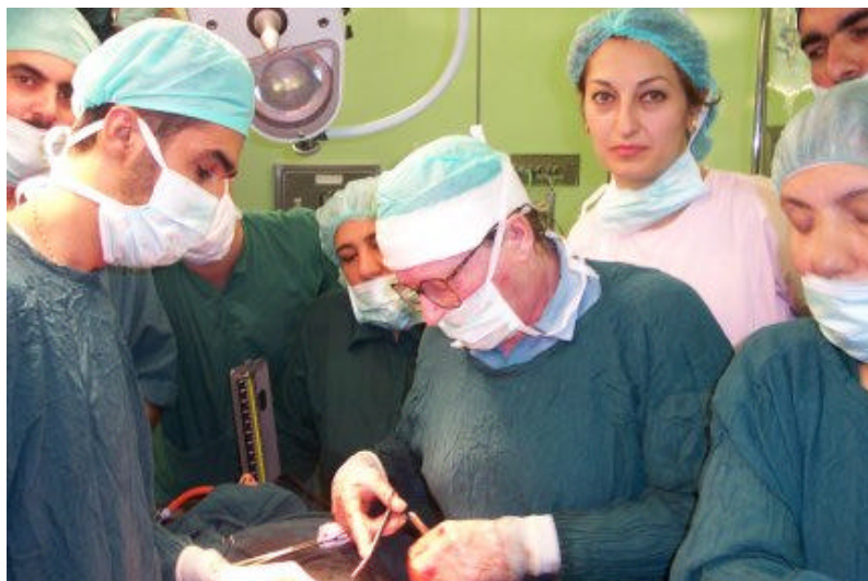
Operating on vesico-vaginal fistula in Erbil

An operating list took place despite this being the theatre staff day of rest. I did a high VVF repair, by an abdominal approach, a retropubic prostatectomy, which they made me do despite their obvious ability in this operation, and insertion of JJ stent without x-ray guidance.