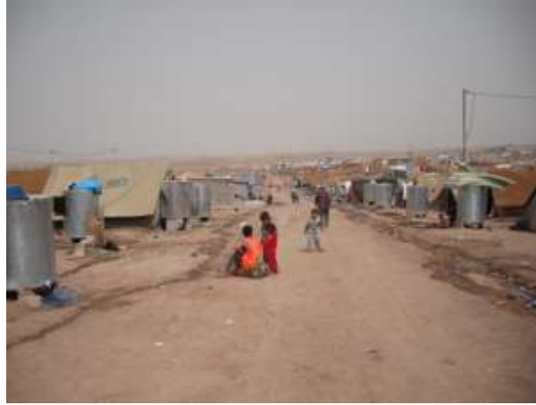
The tents and huts with the water butts and electricity lines in the refugee camp

On Friday 14 th day of rest after all had gone to the mosque we had an afternoon/evening swimming party and barbeque, in Mohammed's sister house. The kids swam during the day and then the men in the dusk when the women had gone in to prepare the food. No mixed adult bathing here except for me!! I declined as the water was far too cold, just out on the mains. Still the chaps had a good time cavorting, I was interested to see how many could not swim