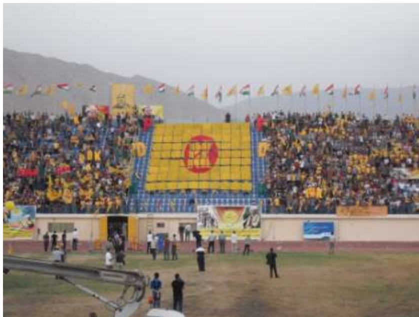
Human PDK flag in Duhok stadium