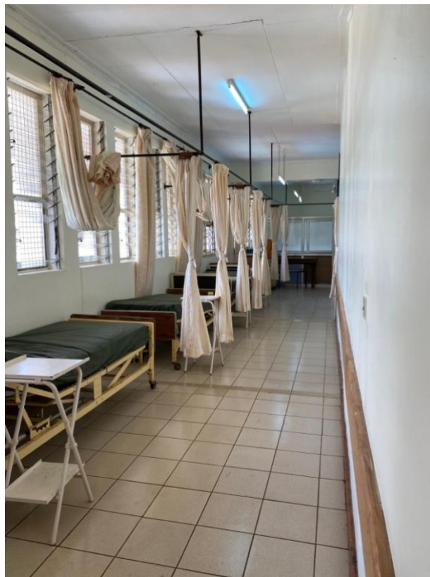
Hospital day ward

On the first day, we attended ward rounds at 7:30am and could immediately appreciate a few differences to urology ward rounds in the UK. The ward rounds are a big group, sometimes with 20 people between the medical students, residents, nurses and consultant. This meant there was a fair amount of crowding around the bedspaces, with some peering over shoulders, but the patients did not seem perturbed. There were lots of urological pathologies to see; some similar to the UK (patients post-TURBT ,TURP and cystectomy) and some different ones (fistulating scrotal TB and schistosomiasis). It became evident over the course of the visit that renal trauma is very common in Tanzania and is usually blunt trauma from road accidents. I had not heard of 'boda boda' drivers before but these motorbikes weaving around traffic, often carrying multiple passengers, are quite ubiquitous around Moshi and Arusha, as taxi services or for recreation.