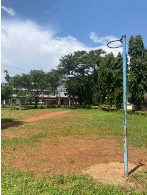
The hospital netball court; possibly the first hospital I've visited with a court!

I was fortunate to be able to take some days to visit the beautiful Serengeti national park and Ngorongoro crater. These were both absolutely brimming with wildlife and the views were sensational. Seeing these incredible natural wonders of the world in Tanzania was a memorable life experience.