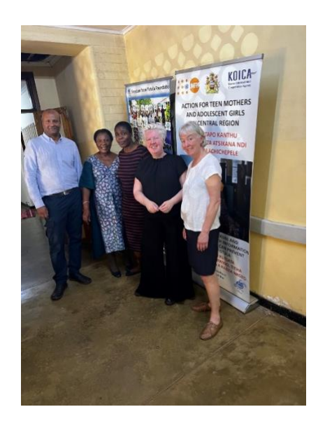
Photo showing the team at KCH and visiting Freedom from Fistula Hospital

The Urolink team wish to run a series of workshops and visits to KCH to provide valuable training to the staff there. It also proposes providing the necessary equipment along with mentorship and support to the local faculty.